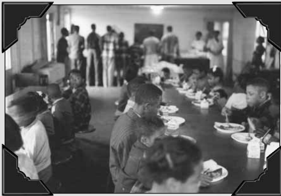
Courtesy of the Phay Collection, University of Mississippi. Students enjoying lunch in the Little Red Schoolhouse.

Rosenwald's support led eventually to the construction of over 5,300 buildings, including almost 5,000 individuals schools across fifteen southern states. Mississippi was second only to North Carolina in building construction, with