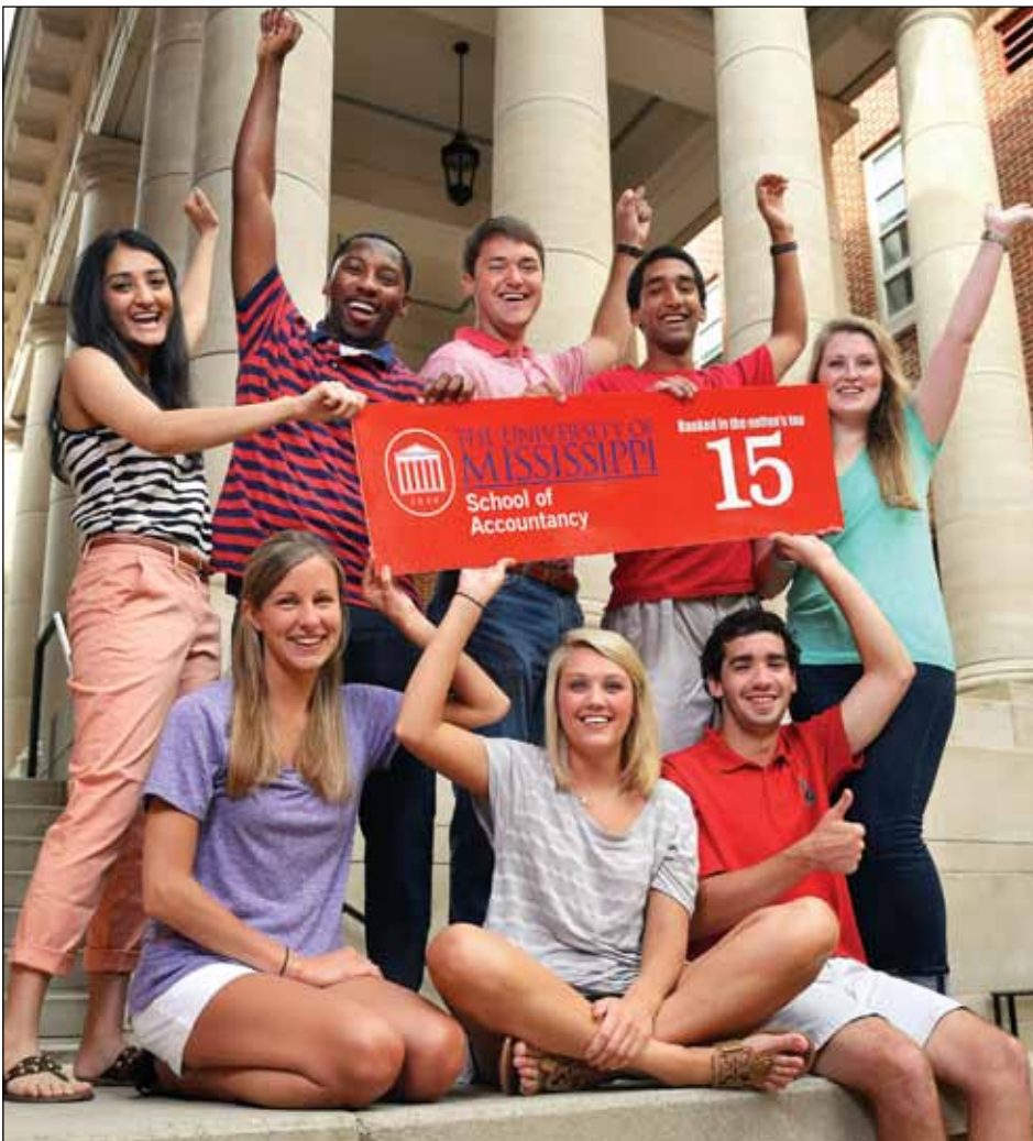
AACSB International renewed the Patterson School's accreditation, taking note of the school's accolades, including the Public Accounting Report's national ranking of the undergraduate, graduate and doctoral degree programs at 10, 11 and 12, respectively.

AACSB accreditation is the hallmark of excellence in business education and has been earned by less than 5 percent of the world's business programs. Today, there are 649 business schools across 43 countries and territories that maintain AACSB accreditation, including 482 in the U.S. Similarly, 178 institutions, including 168 in the U.S., maintain an additional specialized AACSB accreditation for their accounting programs.