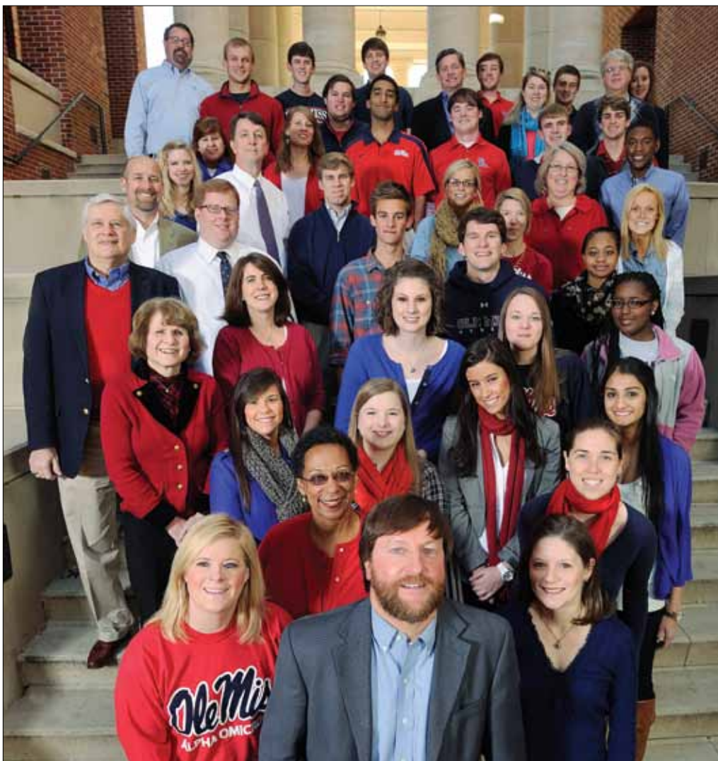
The undergraduate program is ranked No. 10 in the nation in the Public Accounting Report .

H igh fives and broad grins sparked an air of excitement around the Patterson School this spring when word came that the undergraduate program was ranked No. 10 in the nation by the Public Accounting Report , the independent newsletter of the accounting profession.