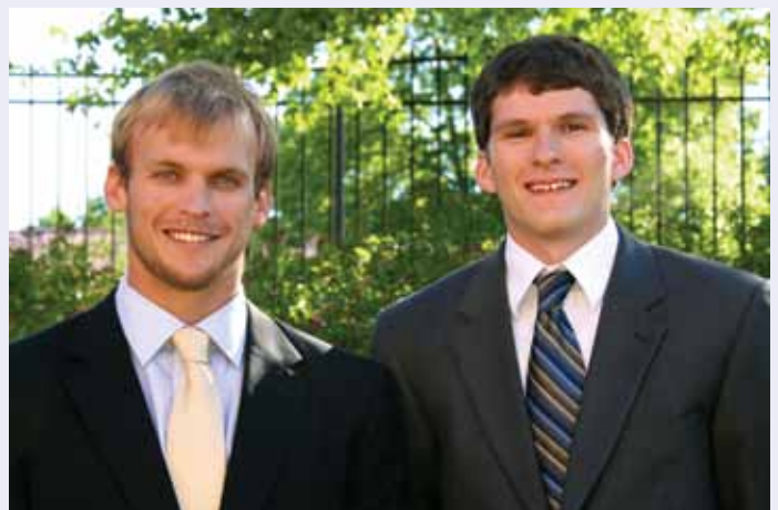
Patterson School Alumni Fellowship 2011