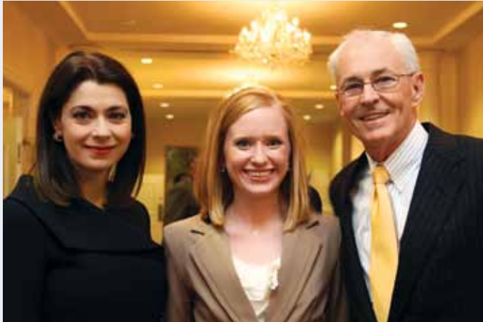
Deloach & Ray Scholarship 2010-11