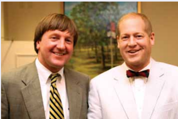
Doctoral Teaching Award 2011