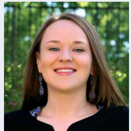
Financial Executives International Scholarship 2010