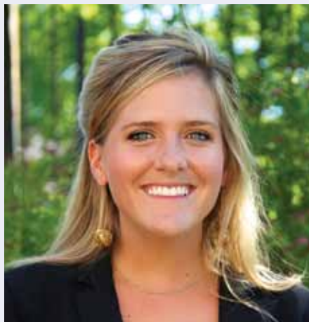
KPMG Peat Marwick Fellowship 2011