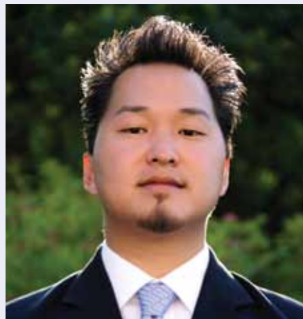
Lefeldt & Co./Waller Fellowship 2011