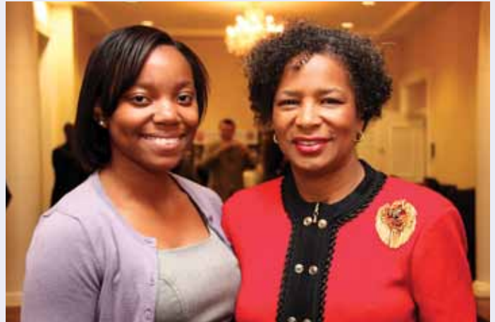
Hickonbottom Women's Council Scholarship