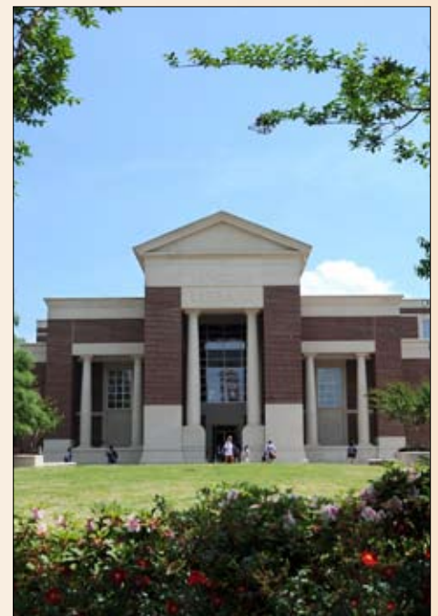
The J.D. Williams Library houses the AICPA collection.