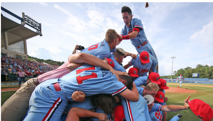
2018: Baseball (SEC Tournament Champions)