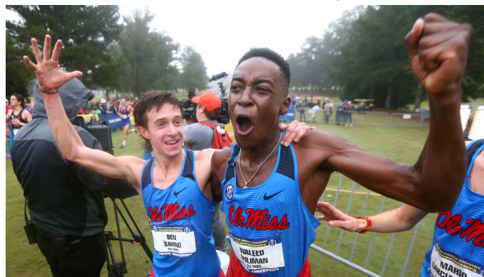
2018: Men's Cross Country

Ole Miss won the 2018 SEC Men's Cross Country title, the first in program history and the first school not named Arkansas or Alabama to win since 1990. The Rebel men went on to win the NCAA South Region title and finish 17th at the NCAA Championships, the second-best national team finish in program history.