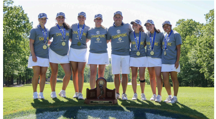
2019: Women's Golf

Women's Golf won the 2019 SEC Championship in thrilling fashion, needing playoff holes in its final three matches before prevailing over South Carolina. Ole Miss went on to qualify for the NCAA Championships for the second time in as many years, finishing tied for 13th overall.