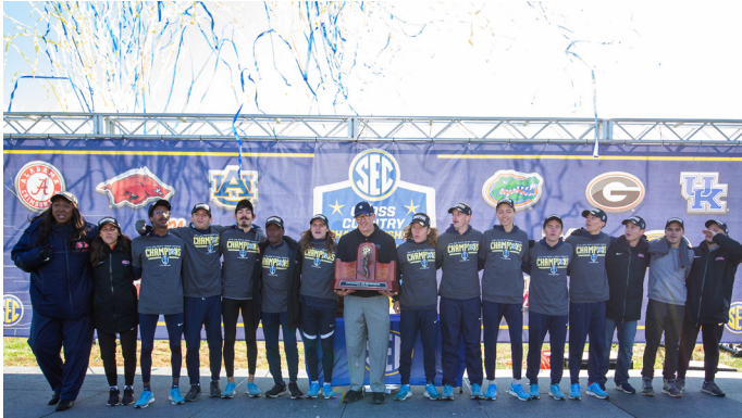
2019: Men's Cross Country

Ole Miss Men's Cross Country repeated as SEC Champions in dominant fashion, recording the largest margin of victory in the SEC since 2015 with a 55-point win over Alabama. The Rebel men were ranked as high as No. 8 nationally during the year, a program-best.