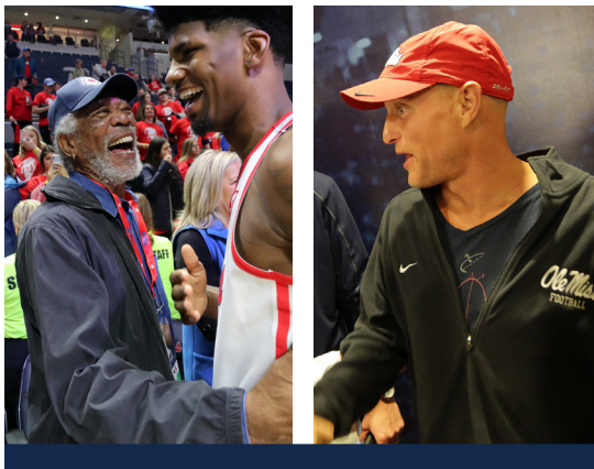
Ole Miss sporting events regularly attract such celebrities as movie stars Morgan Freeman and Woody Harrelson.