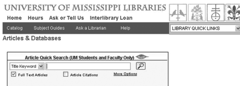
Figure 1. MetaSearch tailored search box with full text category selected

For authentication, the University of Mississippi Libraries purchased Innovative’s Web Access Management Module (WAM), which is based on the