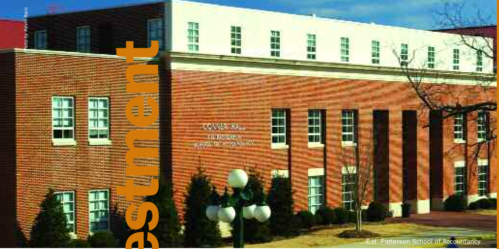
E.H. Patterson School of Accountancy