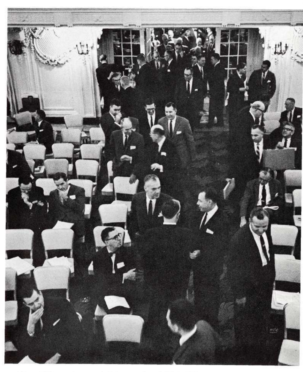
About 160 people attended the meeting, held in Chicago. Here partners begin to return for an afternoon session.