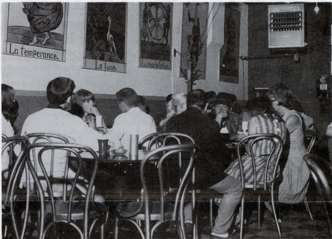
Minister-counselor (back to camera) talks with typical coffee house group.

In another section, the statement asked legislators to extend the benefits of the Fair Labor Standards Act to farm labor and called for better housing, better inspection of housing, and workmen's compensation legislation to cover migrant workers.