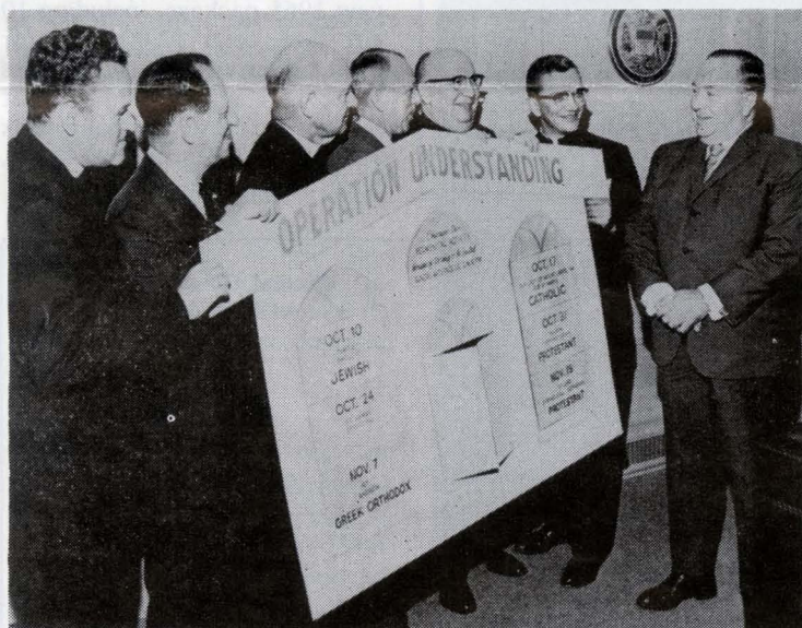
An exchange program of visits to churches and synagogues in the Chicago area attracted wide interest. Mayor Richard J. Daley, at right, learns of results of "Operation Understanding" from Protestant, Roman Catholic, Jewish and Greek Orthodox host clergy.