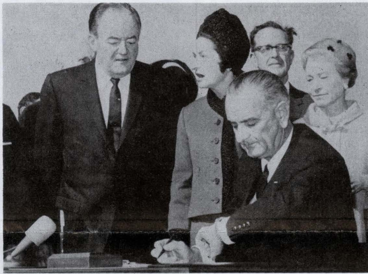
President Johnson signs the new immigration bill, which churches long worked for, as the First Lady and Vice President Hubert H. Humphrey look on. Standing at the right is Mrs. Mike Mansfield, wife of the Senate majority leader, at Liberty Island ceremony.