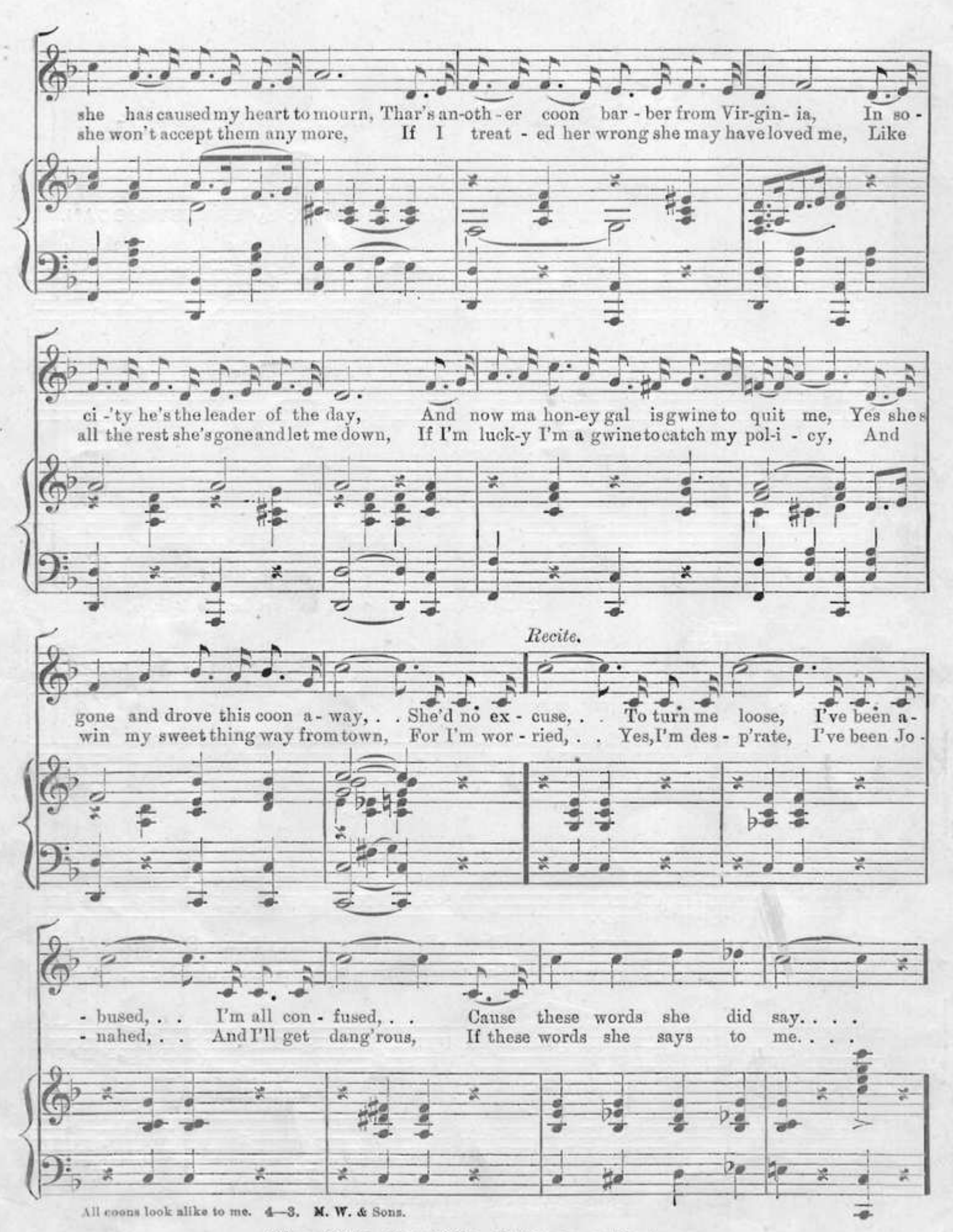
"Two Little Piccaninies sitting on a stile."