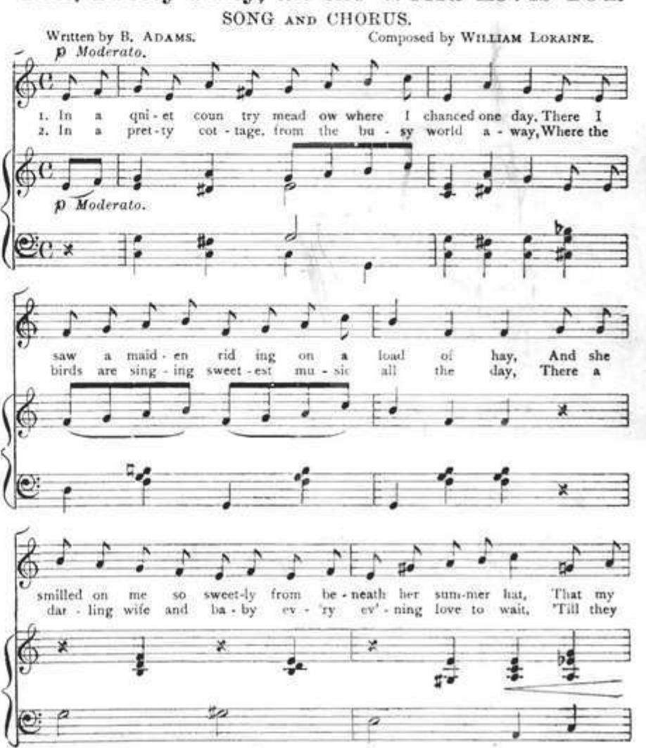
Copyright, 1866, by M. Witmark & Sons. Entered at Stationers' Hall, London, England.