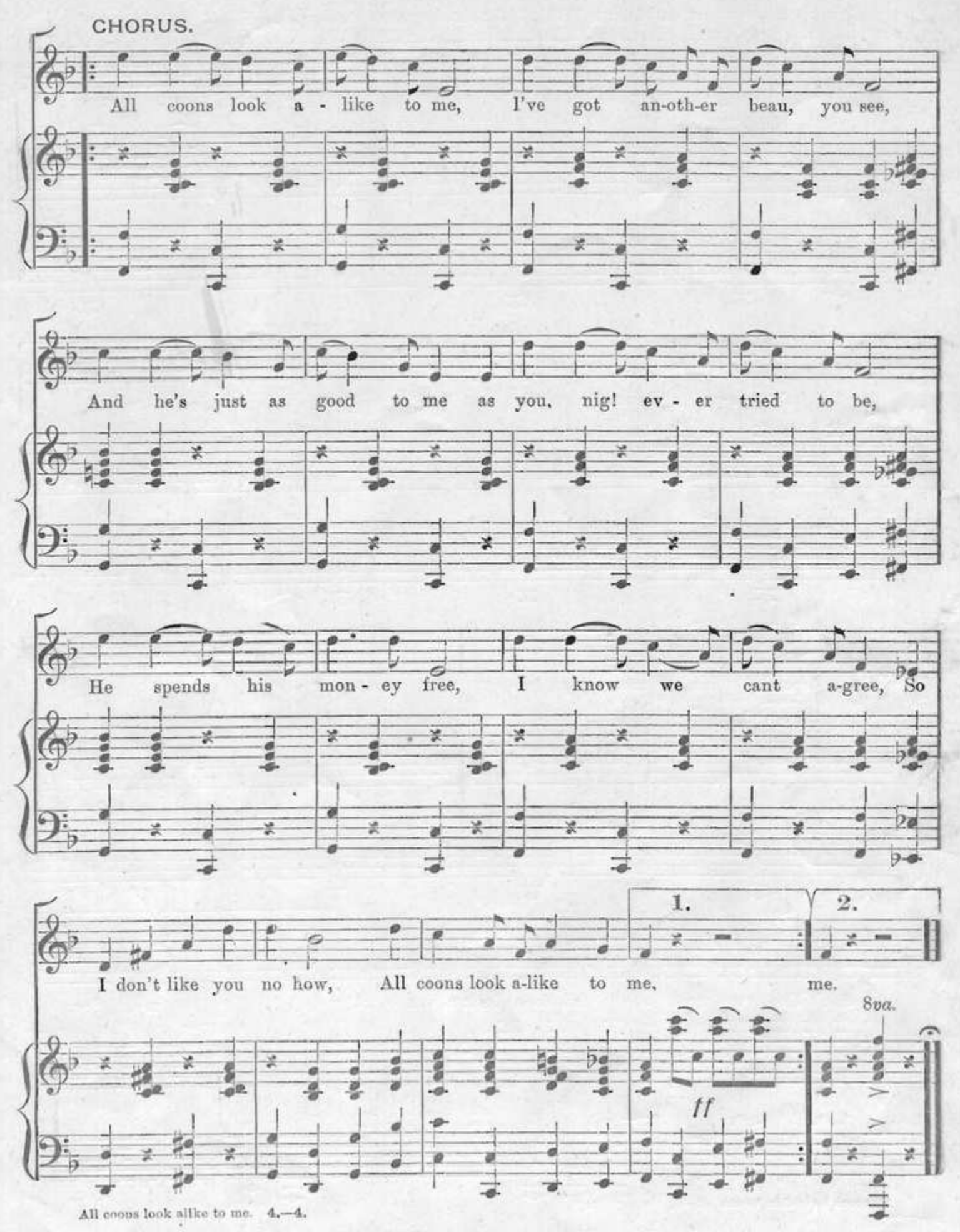
FORD & BRATTON'S NEW ONE.