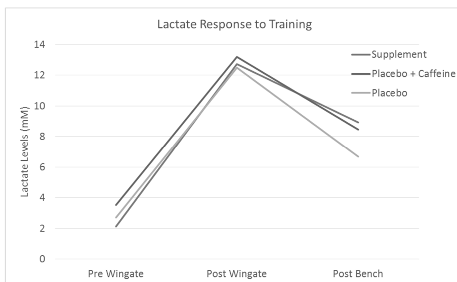
Figure 1. Graph for lactate levels at each of the three time points with lines for each different treatment trial average.

Pre cycle sprints lactate levels were 2.77 \pm 1.61 mM. Post-cycle sprints blood lactate levels were 10.95 \pm 3.28 mM. Finally, post bench press lactate levels were 7.38 \pm 3.62 mM. Overall, there were significant differences in lactate levels for each time point ( p < 0.05 ) (Figure 1), and utilizing LSD post hoc testing by treatment found no significant differences between the different treatments.