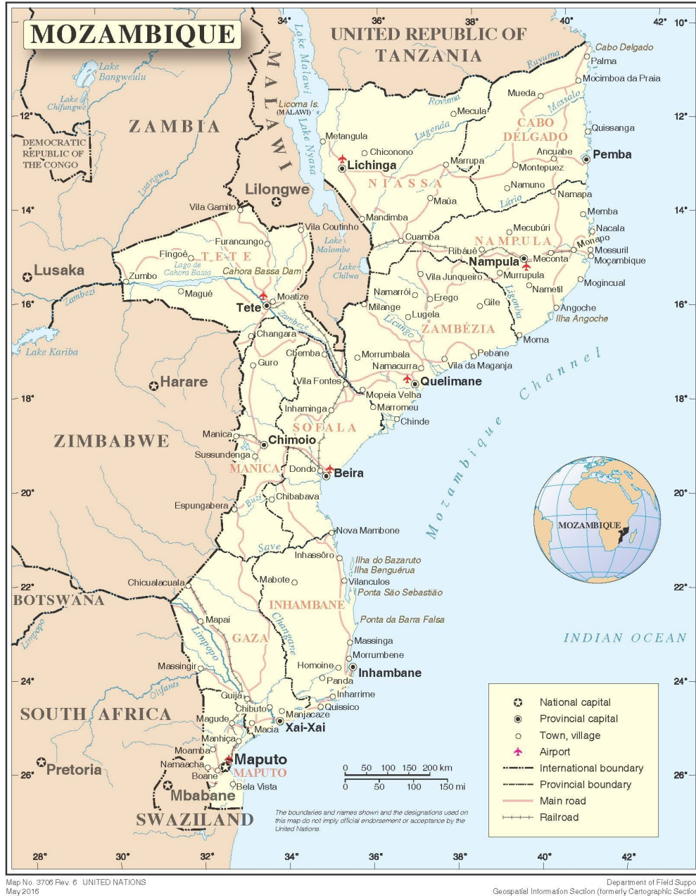
FIGURE 1. MAP OF MOZAMBIQUE AND MALAWI (Source: United Nations 2016).

Malawi, on both sides of the border, belong to the same ethnic groups and therefore share similar cultural practices.