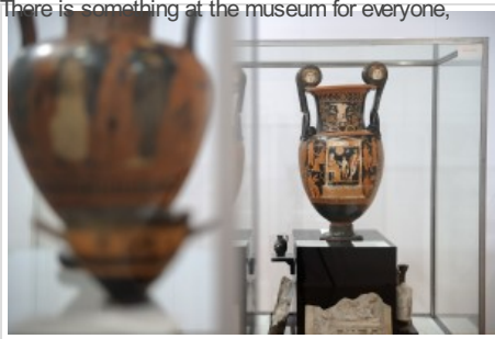
A collection of Greek and Roman antiquities are part of the University Museum's permanent collection.

There is something at the museum for everyone,