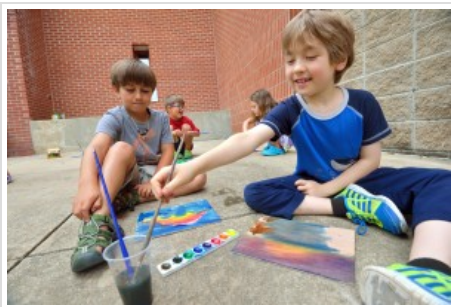
Children participate in activities at the University Museum.

For more information about the museum, click here .