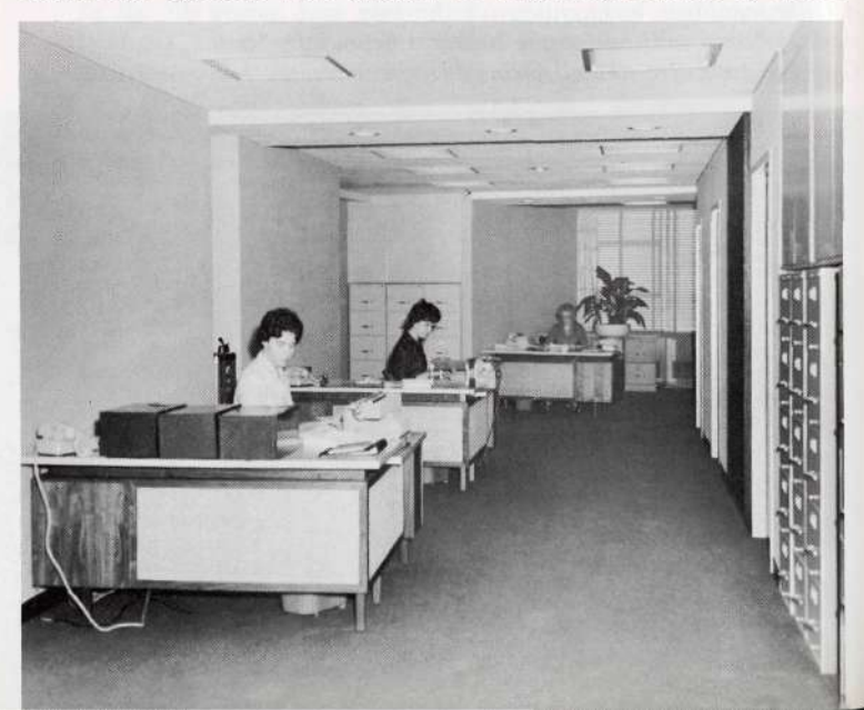
Cathy O'Brien, Ellen Wadden and Anne Seeley (far back) at modern desks. File cabinets were sprayed to match light shade of walls.