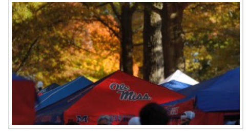
Fall tailgating in the Grove.

"I can say in definitive terms that there isn't a better place to spend a college football Saturday