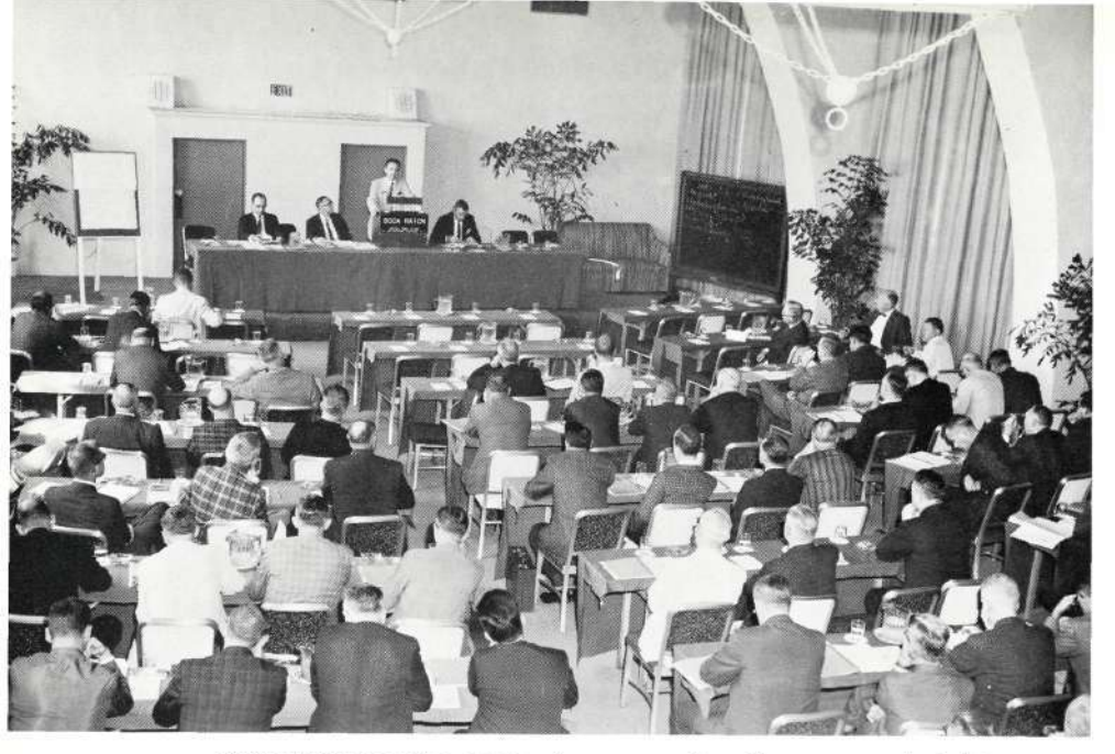
Partners in morning session hear a report on the supermarket picture.