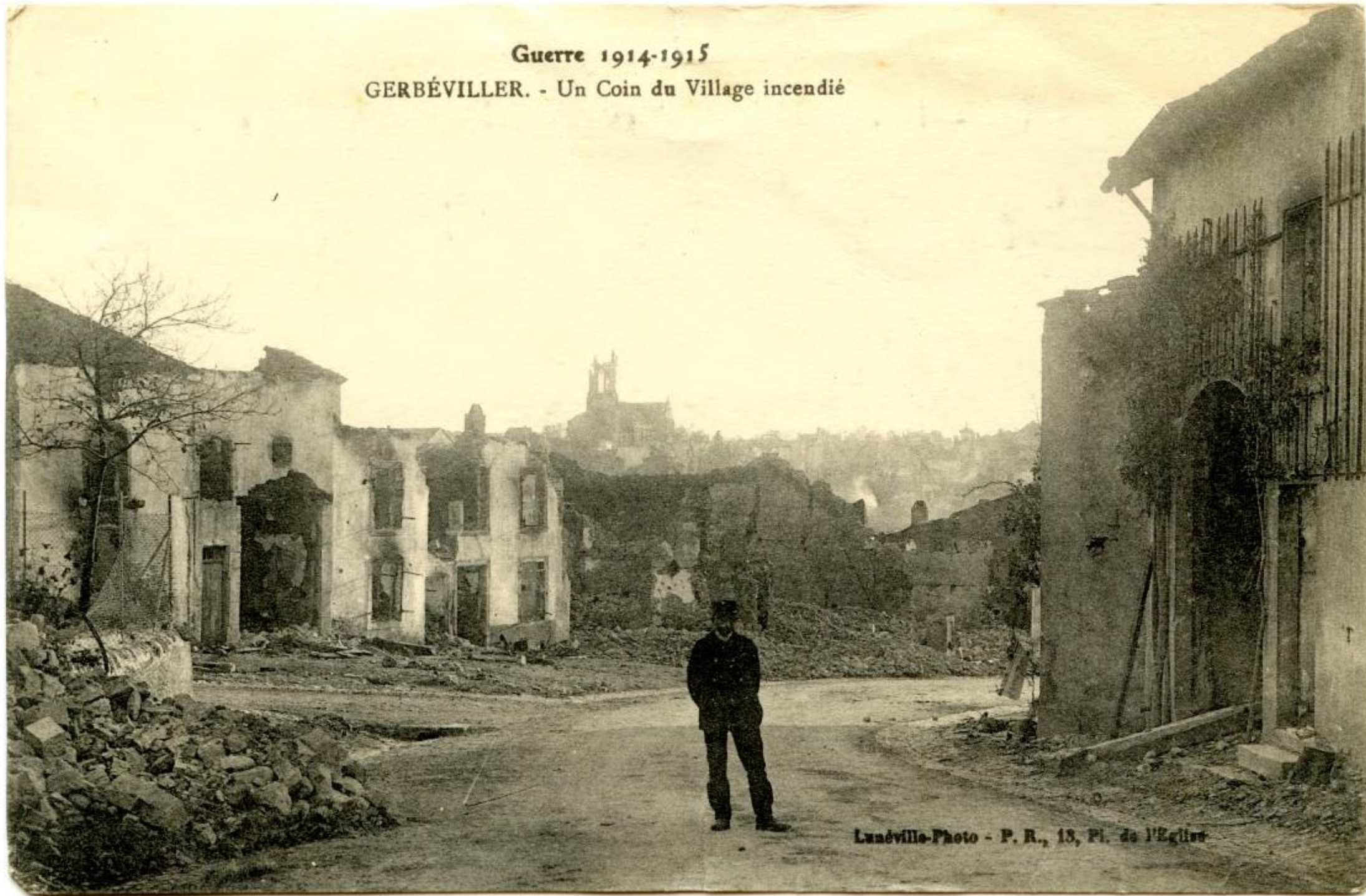
Guerre 1914-1915 GERBÉVILLER. - Un Coin du Village incendié

Lunéville-Photo - P. R., 13, Pl. de l'Eglise