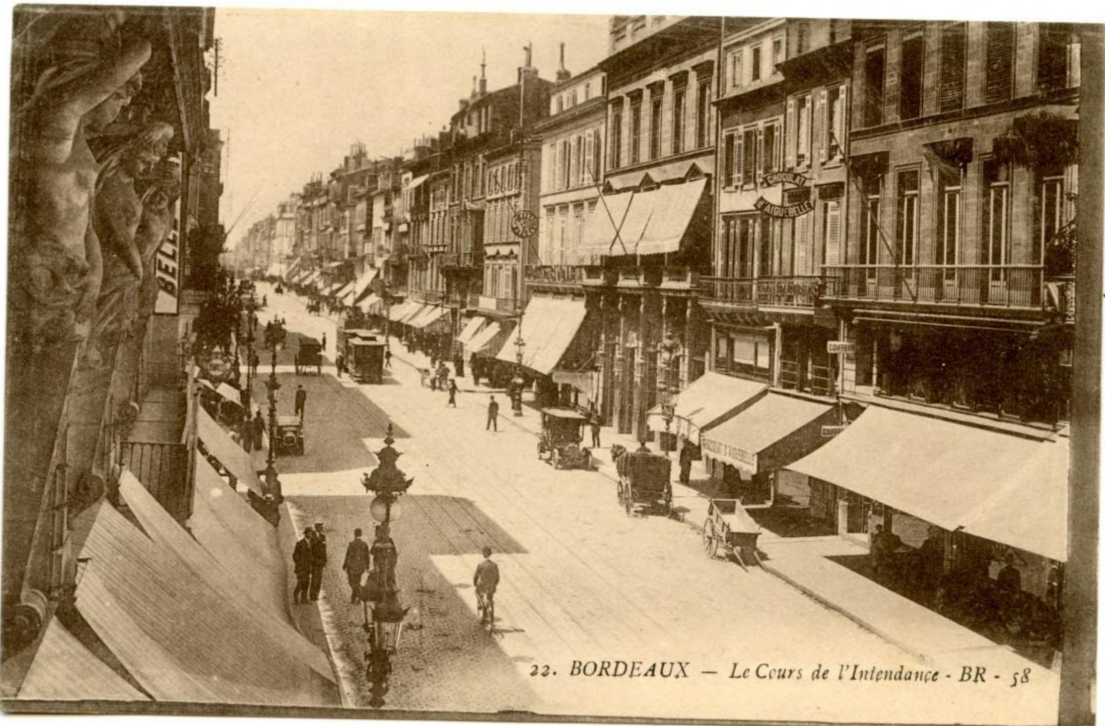
22. BORDEAUX — Le Cours de l'Intendance - BR - 58