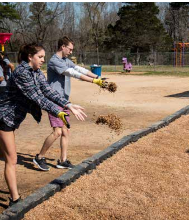
The Big Event has over 1,500 student volunteers and takes on approximately 150 projects throughout Lafayette County.