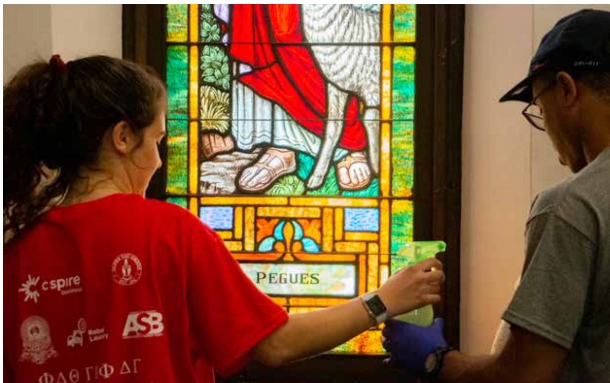
Volunteers cleaned windows and did gardening work at St. Peter's Episcopal Church.