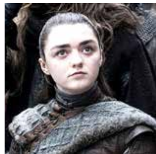
Arya Stark Pre-Med

This girl can slice someone’s face off and not flinch, so she belongs in a bio lab. Arya also practically lives in the Honors College dungeon. She enjoys reporting non-Honors kids for being in the building after 5 p.m. and feels personally attacked when others leave a mess in the kitchen.