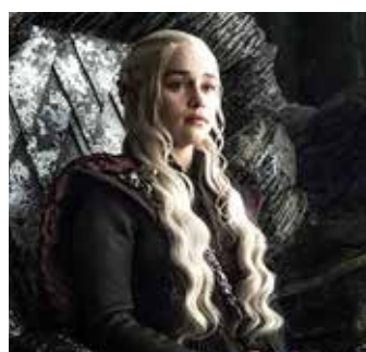
Daenerys Targaryen Foreign Language and Public Policy

Jon is that senior that has taken every possible pre-req in the course catalog but still doesn’t have a major. He frequently says, “I don’t know what I want to do in my life, but I do know what I don’t.” He’s honestly really overwhelmed and doesn’t know where to start. I think we all can relate.