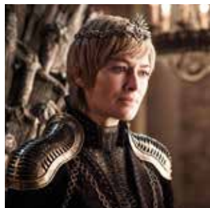
Cersei Lannister Finance

This girl can slice someone’s face off and not flinch, so she belongs in a bio lab. Arya also practically lives in the Honors College dungeon. She enjoys reporting non-Honors kids for being in the building after 5 p.m. and feels personally attacked when others leave a mess in the kitchen.