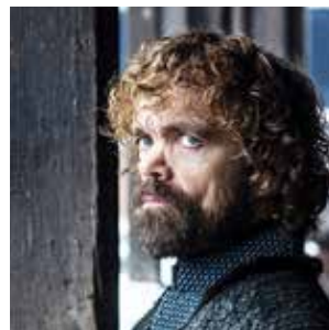
Tyrion Lannister Psychology, Pre-Law

There’s a reason that the Lannisters are the richest family in Westeros. Cersei’s entire life consists of crunching numbers in accounting classes and looking for the best summer internship possible — especially if she knows it’s going to be better than yours. She has “#BossBabe” in her Instagram bio and sells beauty products via direct messages.