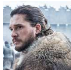
Jon Snow Undeclared

Tyrion is one of those people who can basically read your mind just by looking at your facial expression. Don’t be surprised if you spot him on the third floor of the JD Williams library, surrounded by empty Starbucks cups. Freshmen walk into orientation hoping to be in his group, and any frat party planned by Tyrion Lannister gets talked about for at least three months.