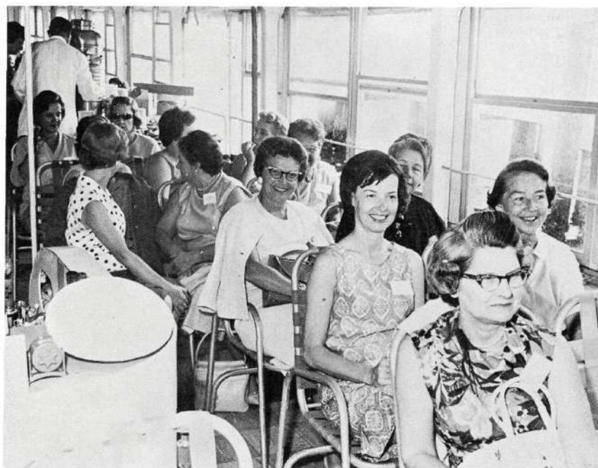
Boat trip to Fort Lauderdale . . .