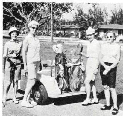
Golfing . . .