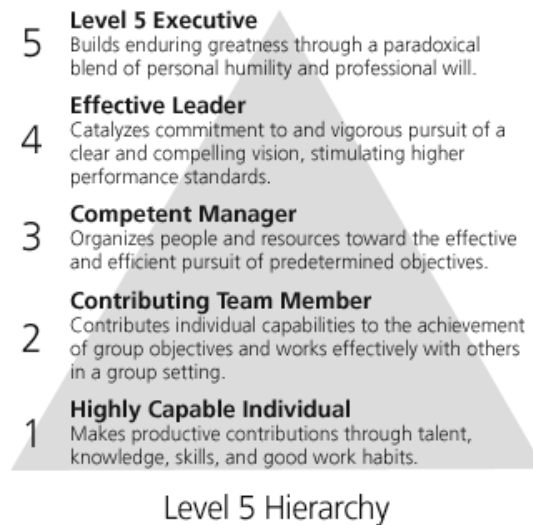
Figure 1: Jim Collins' Level 5 Executive Model

The traits of personal humility and professional will were included in Collins' hierarchy. These general leadership qualities translated across all realms of management, including higher education and student affairs (see figure 1).