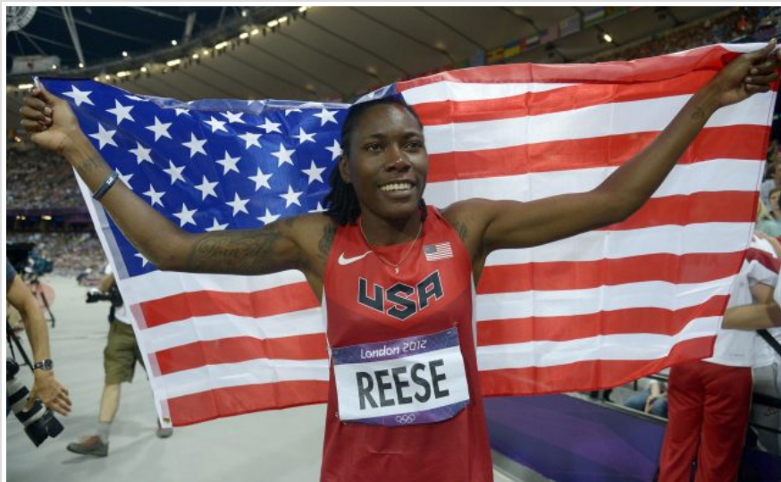
Brittney Reese celebrates with an American flag after winning the women's long jump final during the 2012 London Olympic Games at Olympic Stadium.

Whether they are business leaders, athletics champions, professionals or nurturing providers, these alumni all share one defining characteristic: a legacy of excellence that began at Ole Miss.