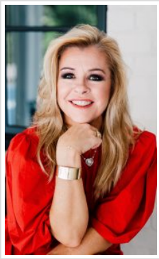
Leigh Anne Tuohy