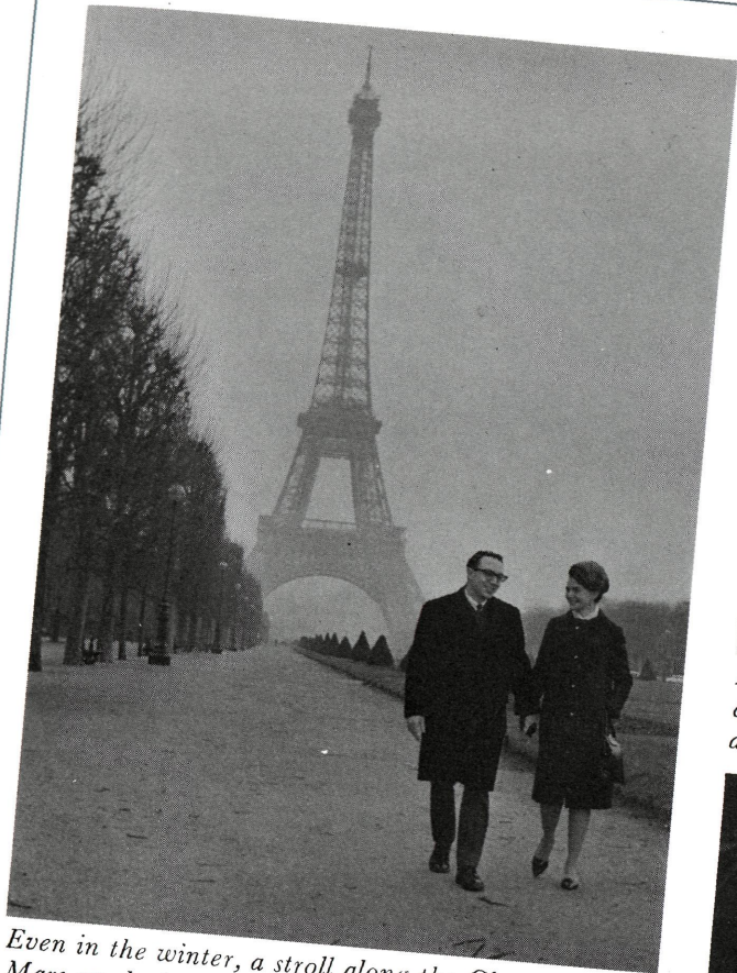
Even in the winter, a stroll along the Champ de Mars can be fun with the exciting Eiffel Tower in view.