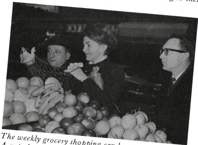
The weekly grocery shopping can be a new experience. A net shopping bag is used to accumulate the many items to be carried home from the neighborhood sidewalk market.