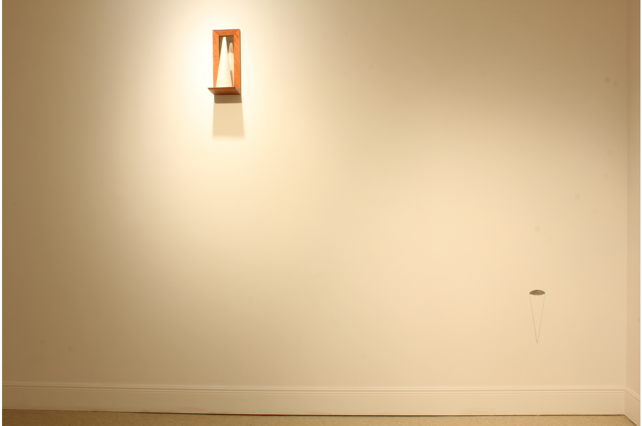
Of Black Holes and Parallel Universes Cherry, pine, plaster, mirror, graphite Dimensions variable 2013