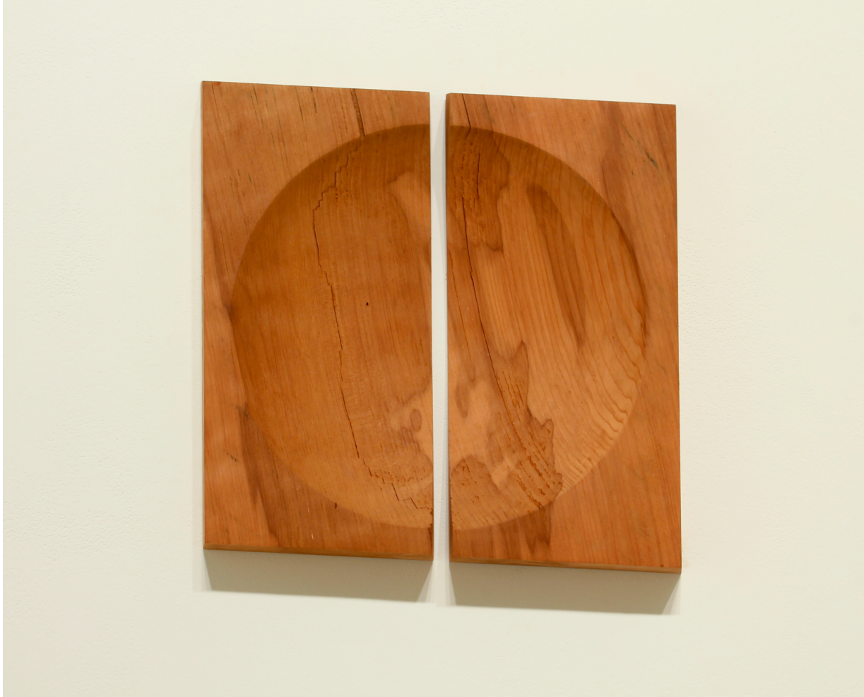
Abeyant II Turned redwood 13" x 13" x 2" 2012