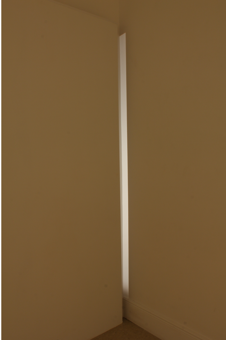
Noumenal Wood, drywall, light 32' x 8' at a six degree angle 2013