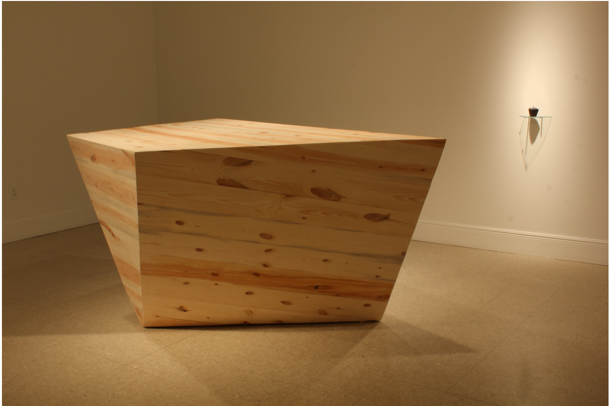
Parallelogram: Model for Finding the Center of Gravity Pine, steel 48" x 96" x 48" each (installation size variable) 2013