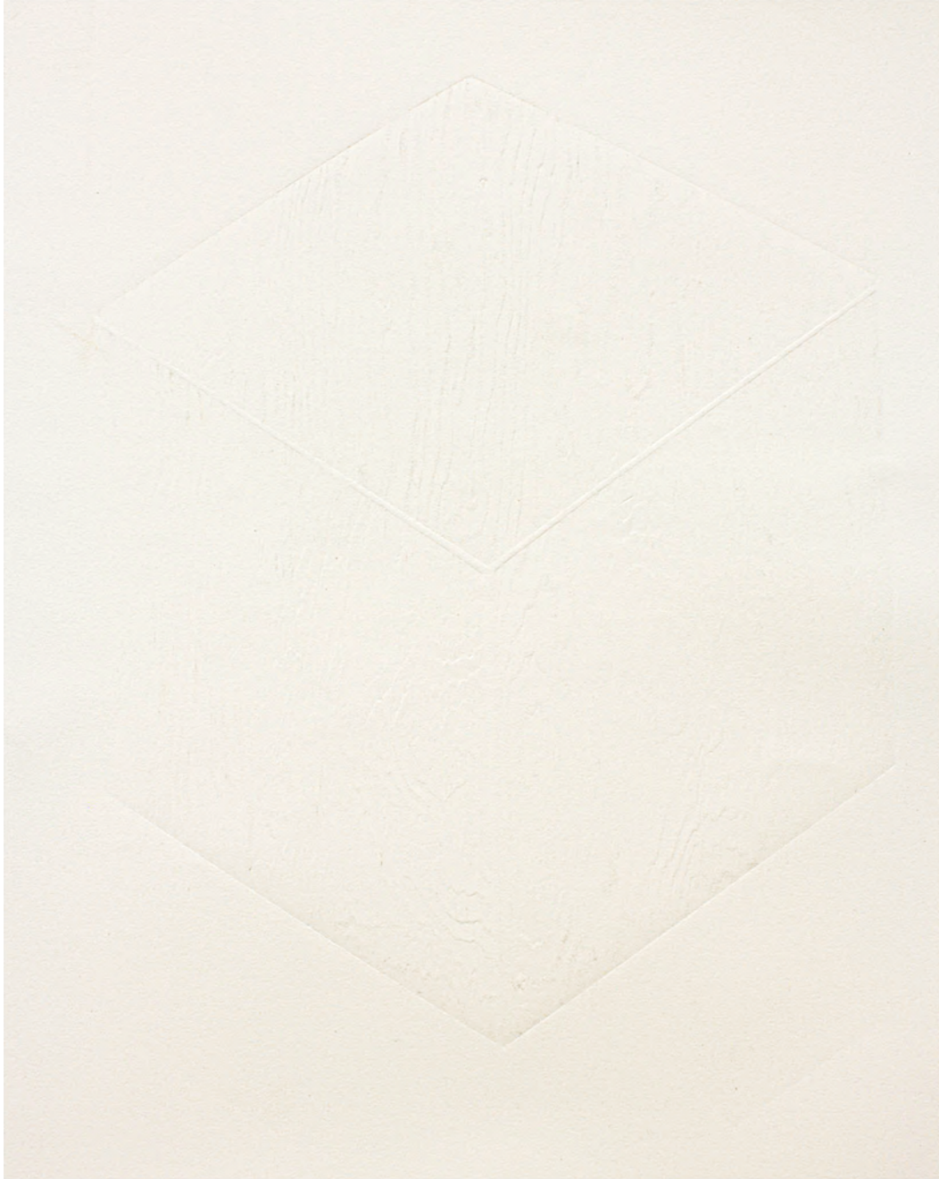
Essence of a Cube Embossed paper 23" x 20" 2013