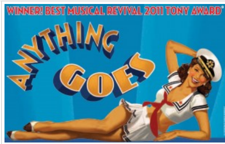
A performance of Tony Award-winning Broadway Musical Anything Goes will be held at the Ford Center Wednesday.

OXFORD, Miss. – The Gertrude C. Ford Center for the Performing Arts continues its lineup of top-notch entertainment this spring, with the national Broadway tour of Tony Award-winning musical “ Anything Goes ” coming up Jan. 28.