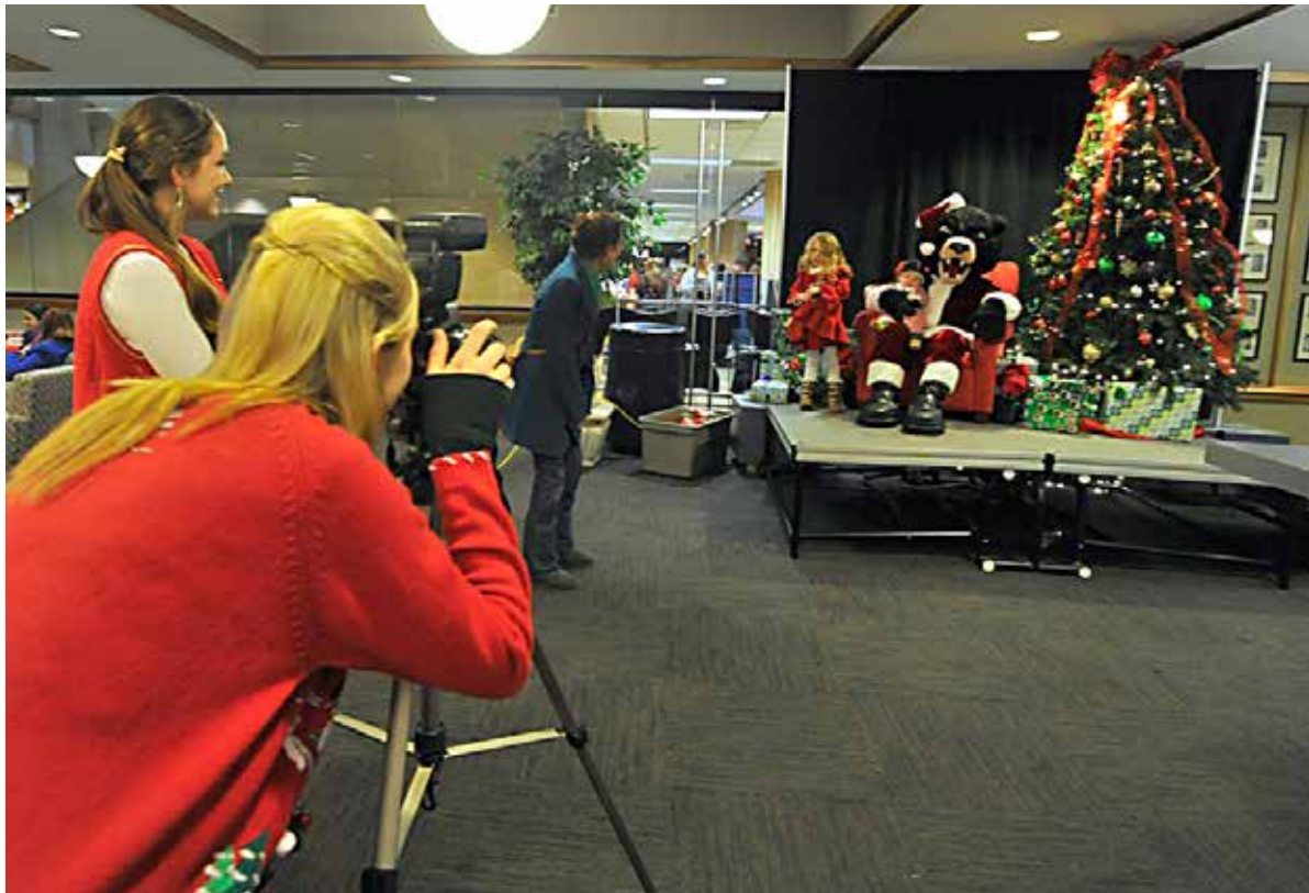
Children take holiday photos with Rebel Black Bear in the Student Union last year.

Beginning at 6 p.m. the annual lighting of the University Christmas tree will take place at the University Circle in front of the Lyceum. This event is sponsored by the Division of Student Affairs, the Ole Miss Student Union, and the Student Activities Association. Special guests