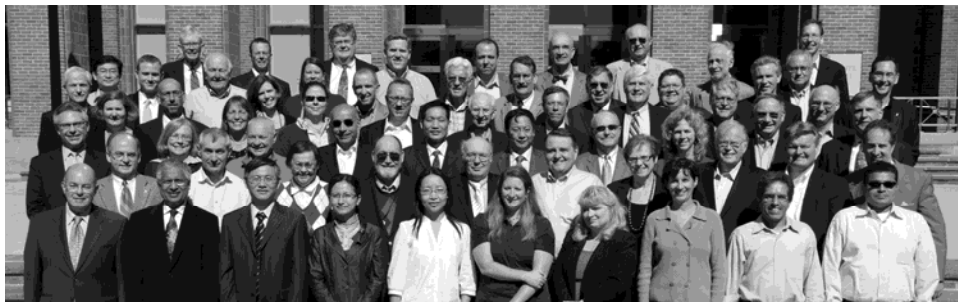
Accounting Hall of Fame Conference Participants

A conference sponsored by The Accounting Hall of Fame and The Academy of Accounting Historians