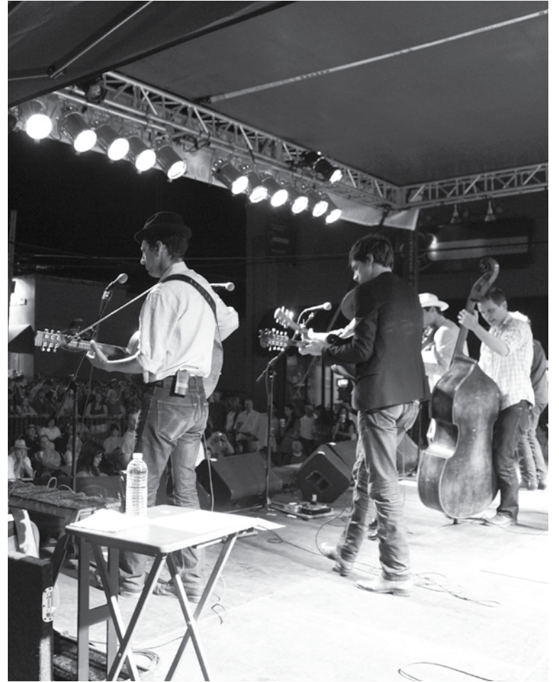
FILE PHOTOS (ADDISON DENT) | The Daily Mississippian