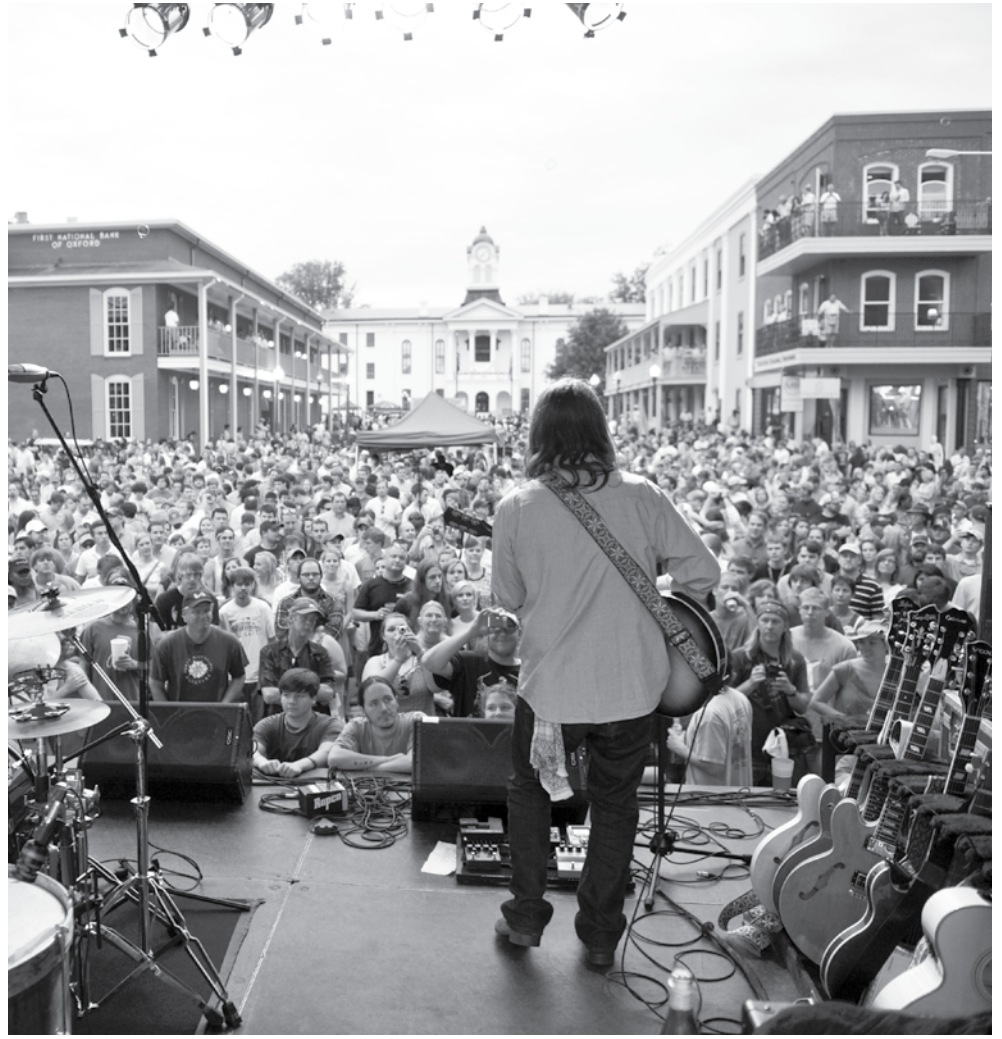
FILE PHOTOS (ADDISON DENT) | The Daily Mississippian