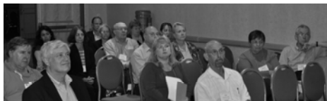
New York Academy Business Meeting Attendees