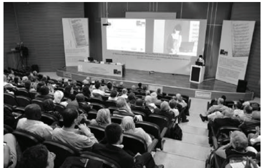
General Meeting of the Conference

Social activities of the conference include a trip to Topkapı Palace. A trip to the new boulding of Ottoman Archives, which consist of 45 million state accounting documents and a night tour with boats over the bosphorus.