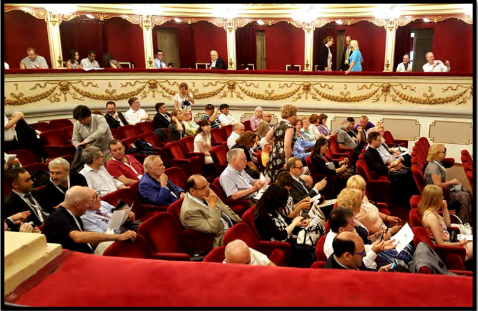
Gathering for the opening plenary session at the Teatro Marrucino.