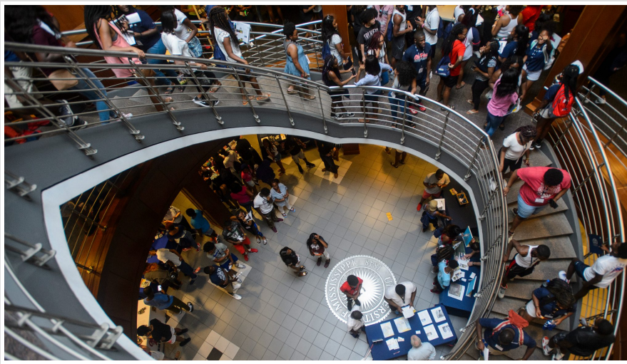
The 2018 MOST Conference welcomes 465 high school seniors, the largest group ever, during an academic and activities fair.

"Because of them, I'm planning to stay focused and be responsible wherever I decide to go to college."