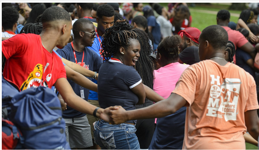
By participating in interactive team building activities, students are empowered and learn valuable lessons during the 2018 Mississippi Outreach to Scholastic Talent Conference.

OXFORD, Miss. – As the University of Mississippi's 2018 Mississippi Outreach to Scholastic Talent Conference came to a close Tuesday (July 17), high school seniors in attendance raved about their three days of pre-college experiences.