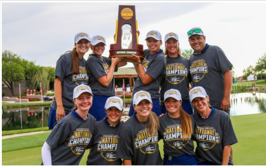
Members and coaches of the Ole Miss women's golf team celebrate winning the 2021 NCAA championship in May in Scottsdale, Arizona. The team used the Tosh Family Short Course to hone their skills in practice and advance to winning the program's first national championship.

OXFORD, Miss. – A former University of Mississippi faculty member's gift to the Ole Miss golf program has literally become a game changer.