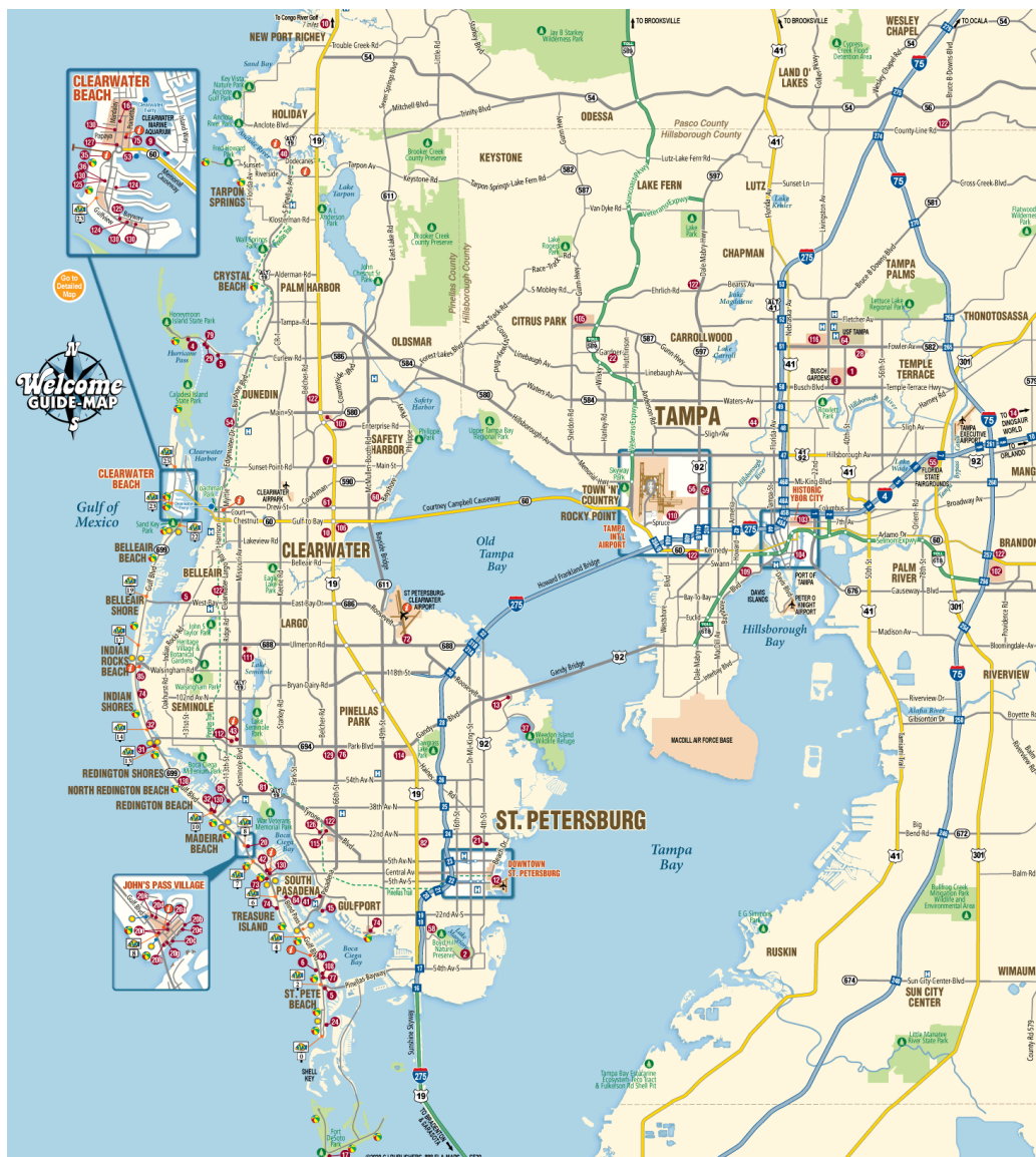
Map of Tampa-Bay Area:

which harbors many industrial and passenger ships in passing. Below the gorgeous downtown skyline there comes the Tampa Riverwalk, stretching through downtown Tampa to Bayshore Boulevard, which is the largest continuous waterfront sidewalk in the world. Here I can visit many interesting restaurants, bars, museums, parks, and stadiums that give life to the excitement of this area. From personal experience, one always finds the most relaxing and enjoyable scenery in the southern sections of the Tampa-Bay area.