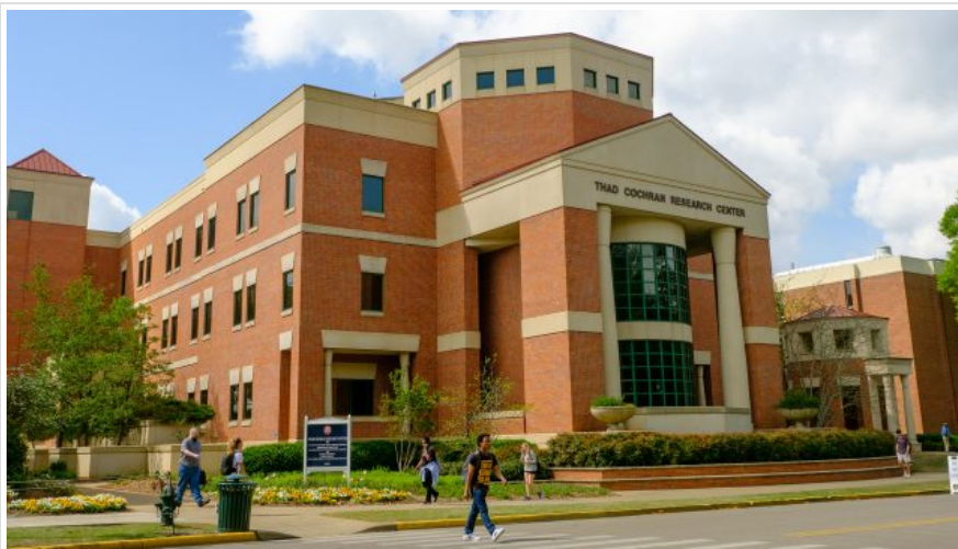
The School of Pharmacy provides a wealth of resources to help graduate students develop research programs that can make a real difference in lives around the state and region, as well as giving them a head start on launching professional careers.

OXFORD, Miss. – At the University of Mississippi School of Pharmacy, students have opportunities to get hands-on experience to prepare them for careers in pharmacy. It's no different for graduate students, who undertake research at the school that can make a real difference in lives around the state and region.