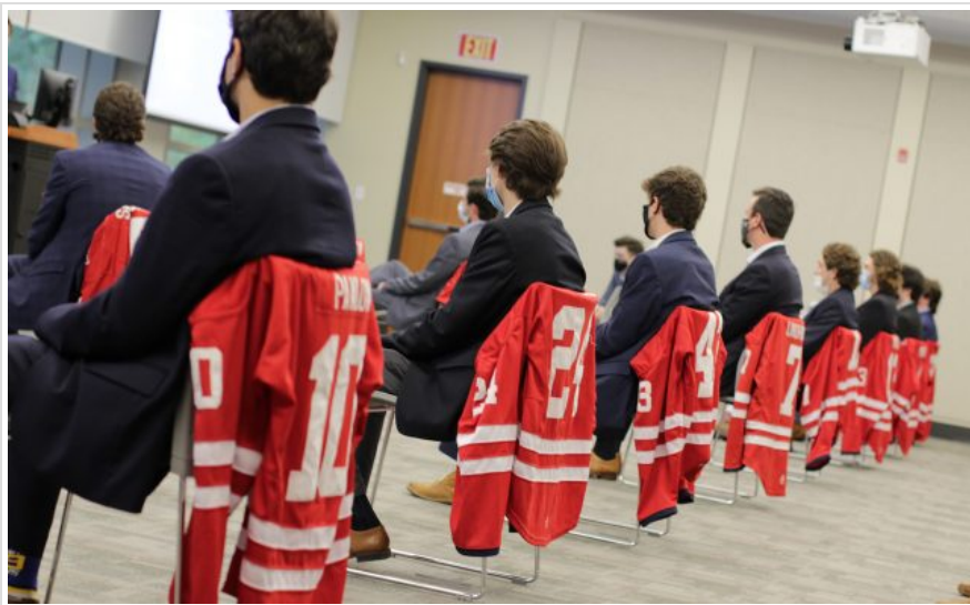
Members of the UM club hockey team gather in October in the Ole Miss Student Union for a ceremony recognizing their 2020 South Eastern Collegiate Hockey Conference championship. Team members received their championship rings at the event.

OXFORD, Miss. – The University of Mississippi's club hockey team made history earlier this year by winning its first South Eastern Collegiate Hockey Conference championship. And although the 2020-21 season has been postponed by COVID-19, the team continues to provide opportunities beyond the ice for its members.