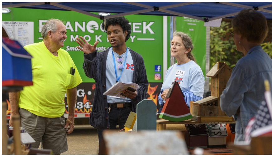
UM students work with community volunteers during the inaugural M Partner Community Day. Students will volunteer across the state Oct. 26 for the second annual Community Day, contributing time and service to projects in Charleston, Lexington and New Albany.

OXFORD, Miss. – Some 150 University of Mississippi students will contribute time and service to community projects in Charleston, Lexington and New Albany later this month for the second annual M Partner Community Day.