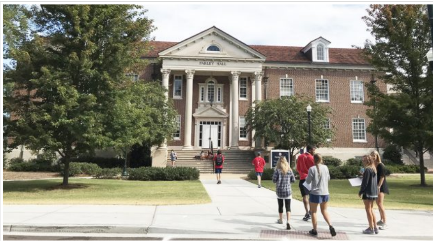
Incoming journalism and integrated marketing communication students at the UM School of Journalism and New Media with great potential and strong work portfolios are encouraged to apply to become Talbert Fellows, an elite cohort within the school.

OXFORD, Miss. – The University of Mississippi School of Journalism and New Media is seeking future journalism and communications students in Mississippi and beyond for a unique program designed to provide exclusive opportunities.