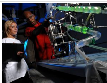
Chemical engineering students conduct an experiment.

This ranking constitutes a comparative assessment of more than 1,000 colleges and universities, measuring factors such as university resources, student engagement, outcomes and environment. The latter includes a gauge of the university's efforts to build a diverse and inclusive environment for