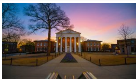
The University of Mississippi is ranked among the nation's best public institutions in several third-party evaluations of academic and research performance.

OXFORD, Miss. – Efforts by faculty, staff and students to excel in their pursuit of knowledge have given the University of Mississippi, the state's flagship university, new momentum in its mission to lead the way in learning, discovery and engagement for the state and nation.