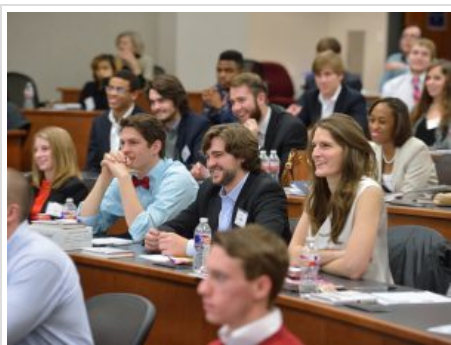
Ole Miss students attending the PULSE Sophomore Leadership get to interact with Corporate Execs from FedEx, Hershey's, Chico and others. PULSE is a two-day sophomore leadership workshop that brings together sophomore students from a variety of roles on campus to learn about themselves and their leadership potential.

Success in international education and research partnerships contributed to the university's standing on U.S. News' 2017 list of Best Global Universities. Among the top 1,000 research universities in 65 countries, UM ranked in the top third on this year's list.