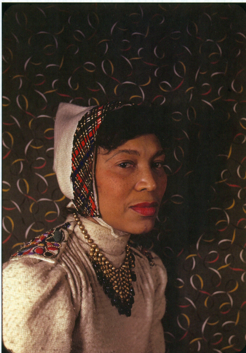
Zora Neale Hurston, 1940, Photograph by Carl Van Vechten Courtesy Carl Van Vechten Trust, Yale Collection of American Literature Beinecke Rare Book and Manuscript Library